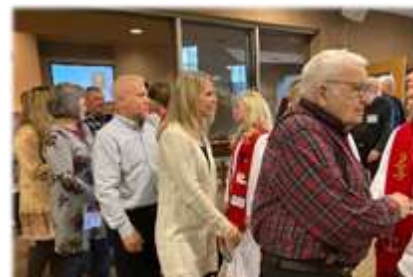
Members of the congregation greeted each Confirmand at the conclusion of the service